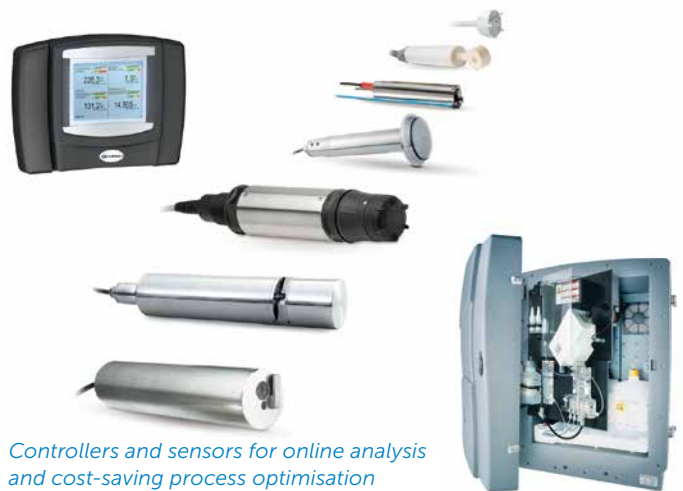
Controllers and sensors for online analysis and cost-saving process optimisation