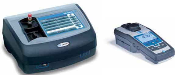
Benchtop and portable instruments for lab analysis inspection, maintenance and equipment qualification services available

* For additional parameters and solutions please contact your local HACH LANGE representative or visit our website.